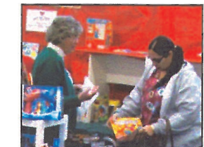
View our Holiday Gift Room photo album at Facebook!

P.S. 2014 is our 45 th Anniversary year! Celebrate with us and the wonderful Friends of UCM! Laugh at the Capitol Steps on Jan. 26 and party at the Friend's of UCM Gala on March 29. See www.ucmagency.org for tickets and details.