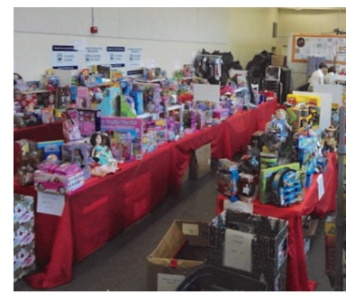
Help fill UCM's Holiday Room with joy this winter!

The holiday season is just around the corner! Based on past years, UCM expects to provide hundreds of families with special holiday food for Thanksgiving and in December -- as well as gifts for children ages infant to 14. We rely on your generosity to make the season special for families in Alexandria who are struggling to make ends meet.