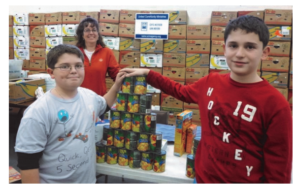
Boy Scouts pose with food collected by the Scouts last year - more than 14,000 lbs!

On that Saturday morning, place food pantry donations by your front door, in the bag provided by the Scouts in advance. They pick up and deliver the food to UCM -- it doesn't get any easier than that!